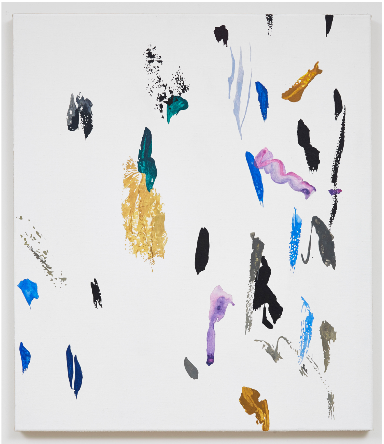
Melissa Gordon, "Material Evidence (Wall)" (2014), acrylic on linen, 23 1/2 x 27 1/2 in

It seems possible to think more critically about the postmodern dogmas with which we have grappled since the 1970s — the loss of authorship and the end of medium specificity. For Gordon, the author and the medium are simultaneously present and lost, begetting a melancholic oscillation between death and life, stasis and regeneration — a drama enacted on the painting's surface. This performance is never fixed, and Gordon leaves us searching in vain for a sure visual or thematic foothold. She pairs "Material Evidence (Wall)" (2014) with "Material Evidence (Wall Zoom In)" (2014) — the latter a painting from a zoomed-in photograph of the former — and, in so doing, creates another realm of signification. The two paintings only become related upon close observation, giving each its own unique, but precarious, authorial status. Gordon's readymades neither reify nor reject the significance of artistic intention or medium integrity, inviting us to critique the multitude of constructed metonyms that have led to the present art historical moment.