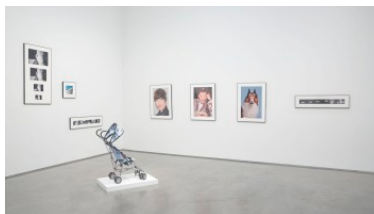
If You Get This Reference, You'll Find John Waters's Exhibition Divine